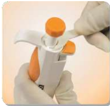
Fig 1: Recalibration procedure